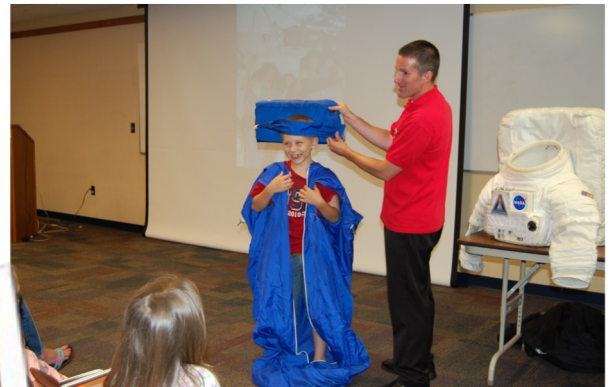
NASA: The Journey to Mars and Beyond visits the library.

E-books: 191,805 Downloadable Videos: 3,751 Downloadable Audio: 52,307 Databases: 81