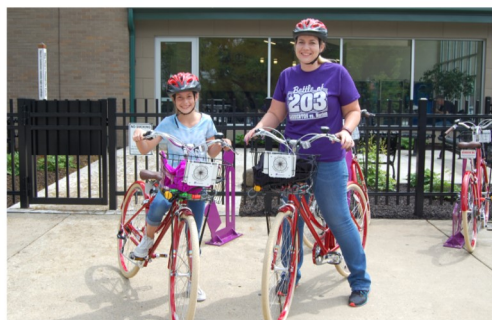
Barberton Bike Share Program